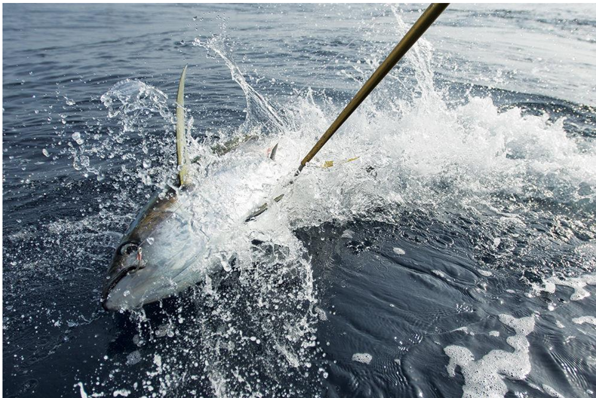
Fisherman gaffing a tuna fish caught deep sea fishing

Certain gaffs float if accidentally dropped overboard. But a floating gaff isn't the silver bullet it appears to be. "In many cases, gaff handles don't displace enough air to give them positive buoyancy — we would have to have much fatter handles and smaller hooks to get all of our gaffs to float," says Stotesbury. "Slender gaff handles are much more functional than fatter models."