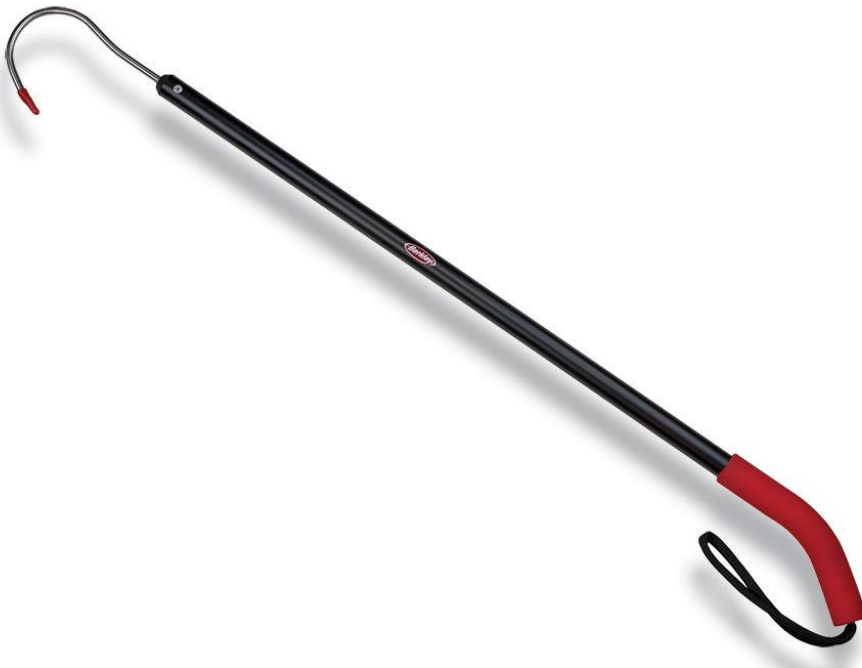
Berkley aluminum fishing gaff with lanyard

AFTCO's two most popular gaffs are 4- and 6-footers with 4-inch gaff hooks. "They are the two most popular sizes for gaffing tuna, probably the most commonly gaffed fish," says Stotesbury. "The 4-inch hook gets a big bite of flesh, which makes it difficult for the tuna to pull off or open the hook."