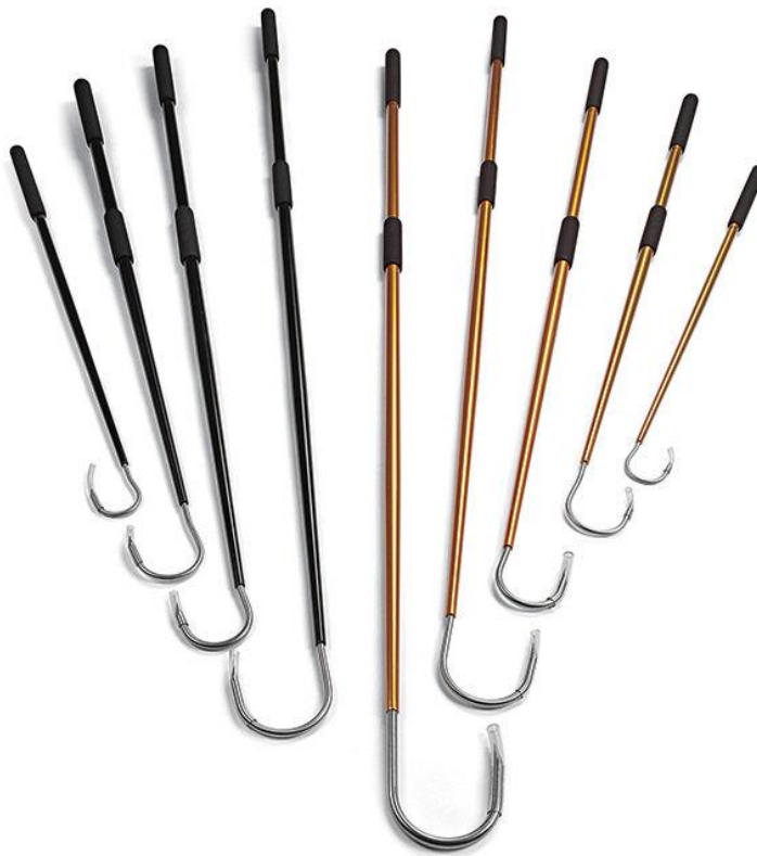
AFTCO fishing gaffs

“Handle lengths have a lot to do with boat size and personal preference,” says Greg Stotesbury, AFTCO ’s sales manager. “Shorter gaffs are easier to store and handle, but their shorter length requires the gaffer to wait for a close, clean shot. Many boats have storage issues with gaffs longer than 6 feet.”